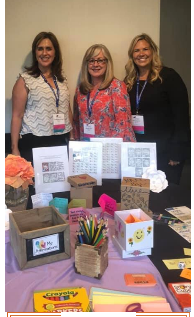
The team at Billy's Place is always ready to train, educate and advocate for our Billy's Place families